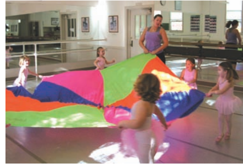
Camp Orinda Fees/Per Person/Per Session INCLUDES ALL ADMITTANCE & TRANSPORTATION FEES!

Camper Information: Parents are required to complete and return a liability and medical release form prior to the first day of camp. Forms are mailed to those enrolled and are available on our website. Campers must bring a lunch, drink, and snack. Extended campers should also bring a breakfast and afternoon snack. Parents are responsible for prompt drop-off/pick-up of participants. A late fee will apply for late pick-up.